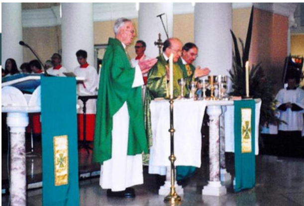
Mass at St Francis of Assisi, Paddington, NSW in May 2002 to launch Catholic Earthcare Australia.

In 2022, we celebrate Earthcare's ongoing role in leading Catholic families, schools and parishes in spiritual transformation, ecological dialogue and action to care for our common home.