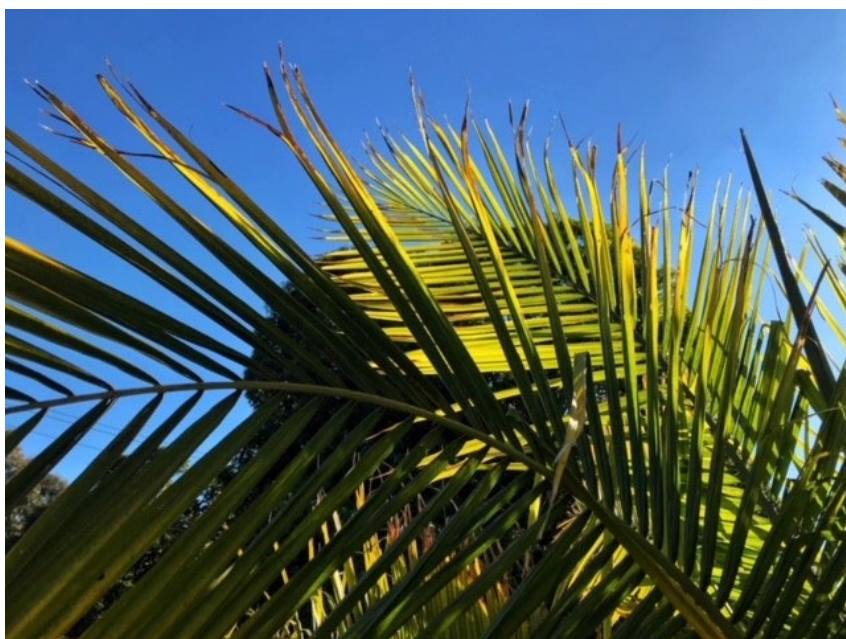
Macrozamia fronds.